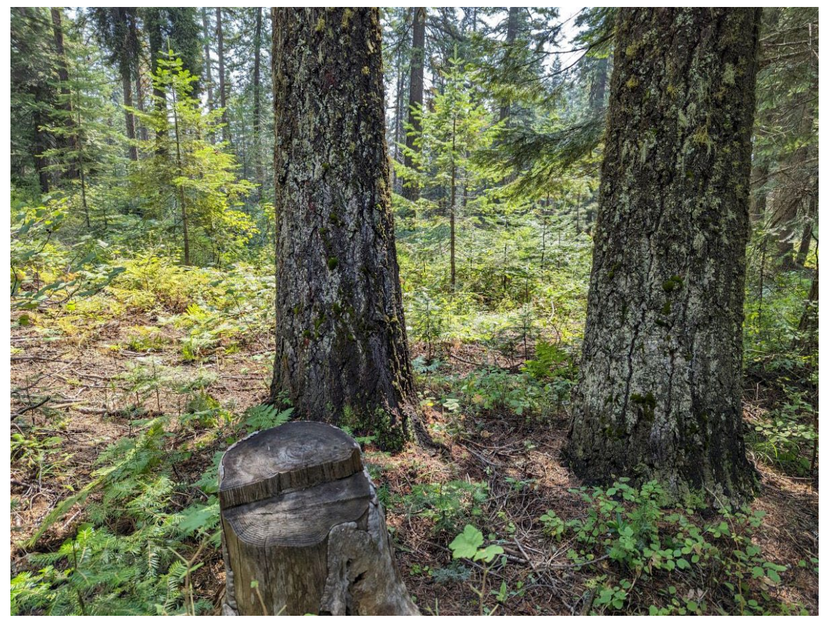
In the Clarks Project outside of Halfway, the Forest Service is proposing commercial logging in Old Growth Management Areas (like the one pictured above).