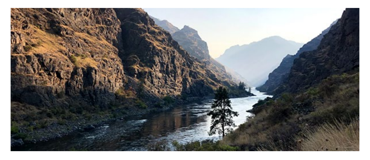
GHCC works to protect, connect, and restore the lands, waters, native species, and climate resiliency of the ecologically magnificent Greater Hells Canyon Region.

The Baker City Herald <u>published a fantastic feature</u> on the Blue Mountains Trail and Renee Patrick's recent solo thru-hike. The in-depth piece captures the excitement surrounding the progress on the trail. <u>Sign up to our email list</u> to receive regular trail updates.