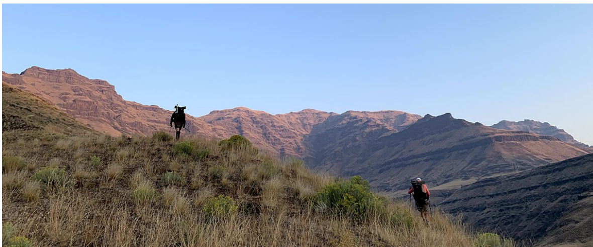
Hiking along the Western Rim Trail.