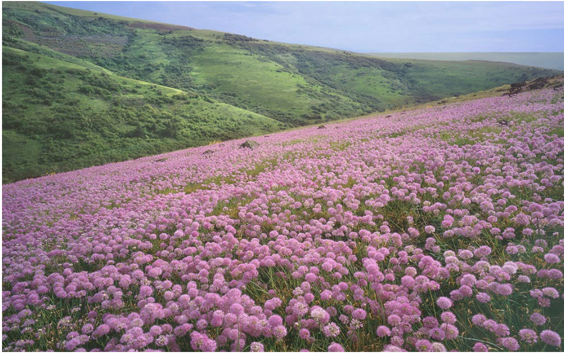
Wild onion blooms in the Blue Mountains.