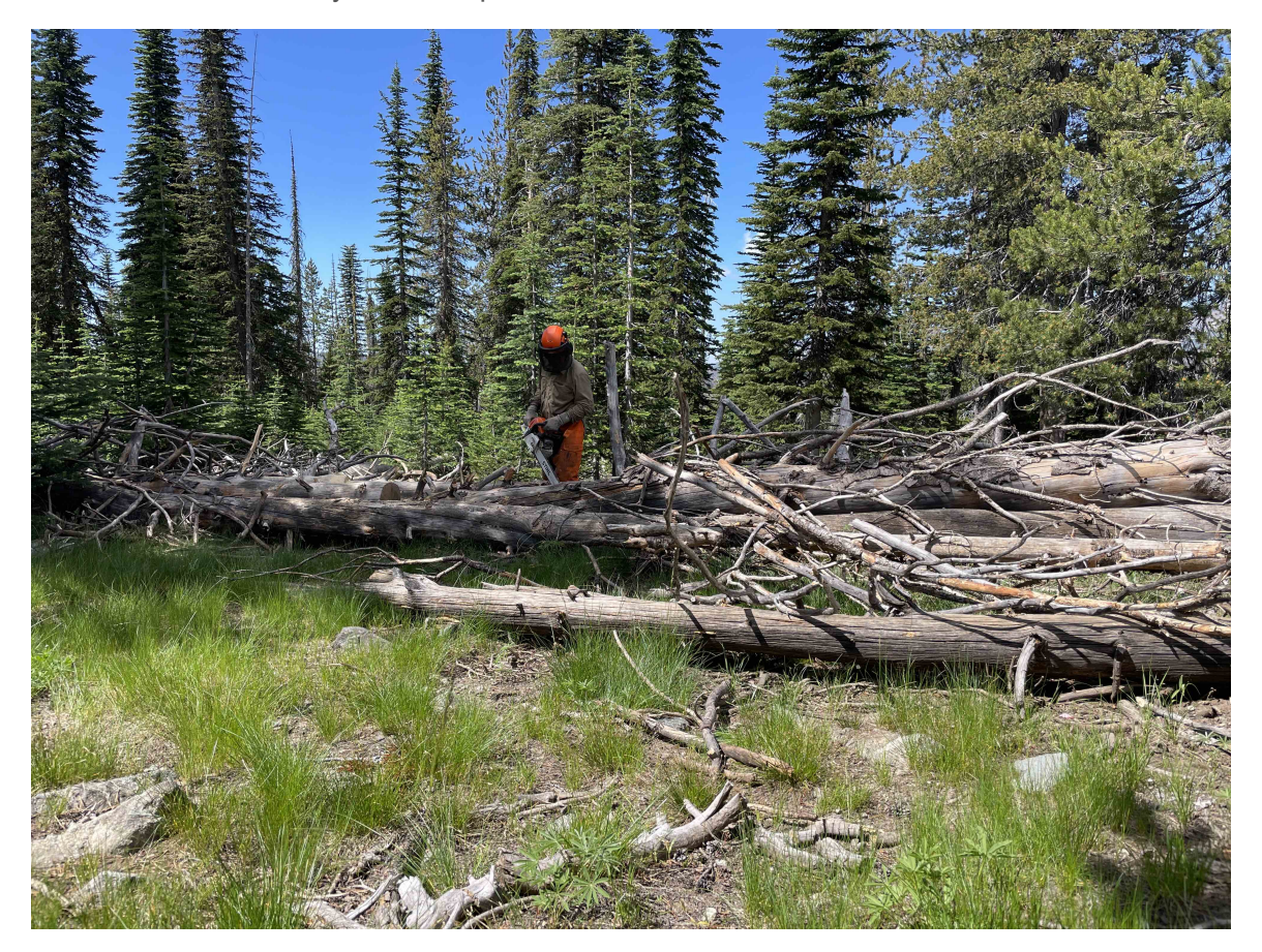
A volunteer works to clear fallen trees from the Blue Mountains Trail.

Improving our neglected public trail infrastructure is an important part of our work on the BMT. Partnerships with other organizations and volunteer agreements with the National Forests allow us to get hands on with trail maintenance. This year, GHCC staff and volunteers were directly involved in maintaining ~17 miles of trails in the Southern Wallowas, Hells Canyon, and the Malheur National Forest. This work included logout, brushing, sign repair, and condition reporting on and off the BMT. Many more miles of the trail and its tributaries were ground-truthed to identify areas of need for future projects. If you'd like to join us in the field, please get in touch and take our volunteer survey to let us know how and where you can help.