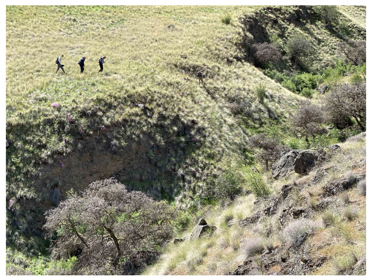
Volunteers hike towards their trail maintenance project on the Blue Mountains Trail.