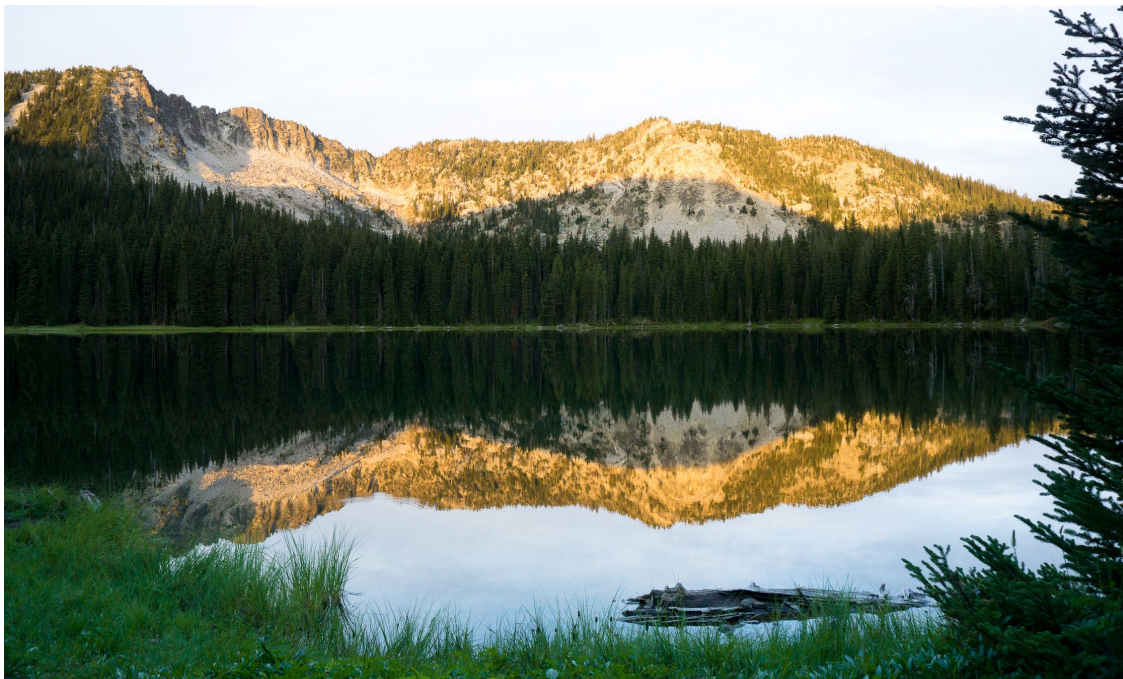
Baldy Lake beneath Mount Ireland.

On Thursday, July 15, the Elbow Creek fire started along the Grande Ronde near Troy and quickly spread down the canyon. The image above shows the fire as of Sunday, July 18 in proximity to the Blue Mountains Trail. Firefighting efforts quickly worked to protect the communities of Troy and Eden Bench. Updates on the Elbow Creek Fire are available here .