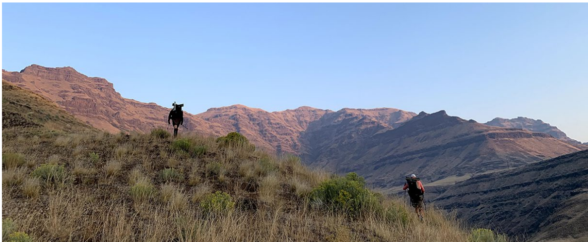
Hiking along the Western Rim Trail.

We have launched an Instagram page for the Blue Mountains Trail to share photos from the trail, the region, and other trail content. If you're an Instagram user, we'd love to have you follow us and share your photos using the #BlueMountainsTrail tag.