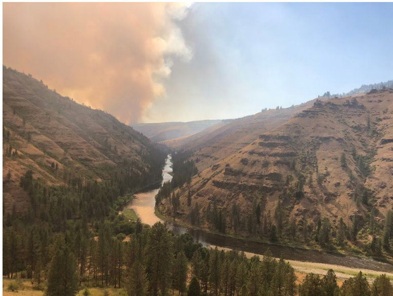
The Elbow Creek Fire burns near Troy, Oregon.

TRAIL CLOSURES: On Friday, July 16, the Umatilla National Forest issued a temporary closure across the entire forest in response to fires burning along the Grande Ronde River near Troy and further north in Southeast Washington. All of Section 3 and much of Section 6 of the Blue Mountains Trail cannot be accessed while this closure is in effect.