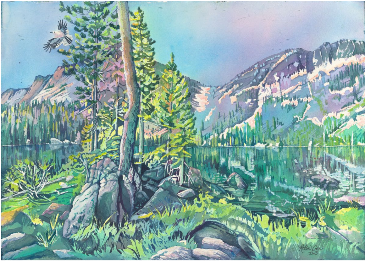
"Summit Lake" from "Refugia of the Blue Mountains" exhibit. Art by Robin Coen.