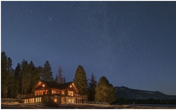
Good Bear Ranch in the Elkhorn Mountains. A 3-night stay here is one of the four auction prizes in the Golden Raffle.

stay at Good Bear Ranch in the Elkhorn Mountains outside of Baker City, a 4-night stay at a Bend vacation home, or a 3-night stay at Barking Mad Farm in Enterprise at the foot of the Wallowa Mountains.