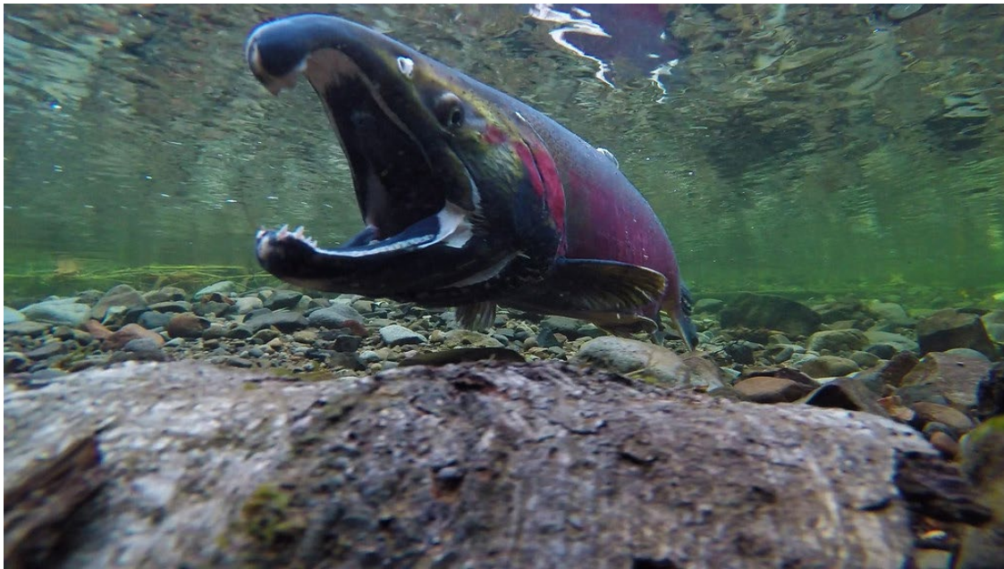
"Coho Spawning on the Salmon River"