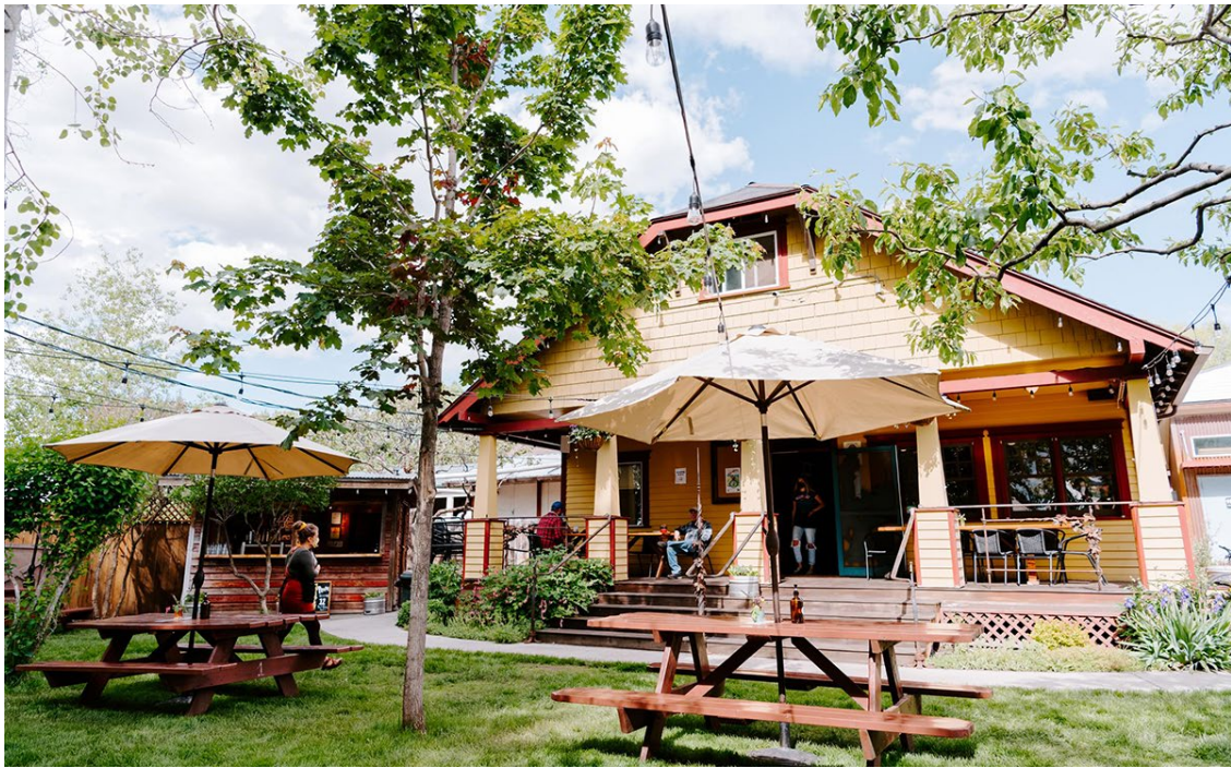
Photo of Terminal Gravity Brewpub