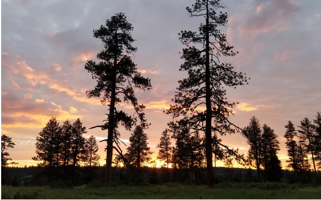
Sunset at Buckhorn Overlook.